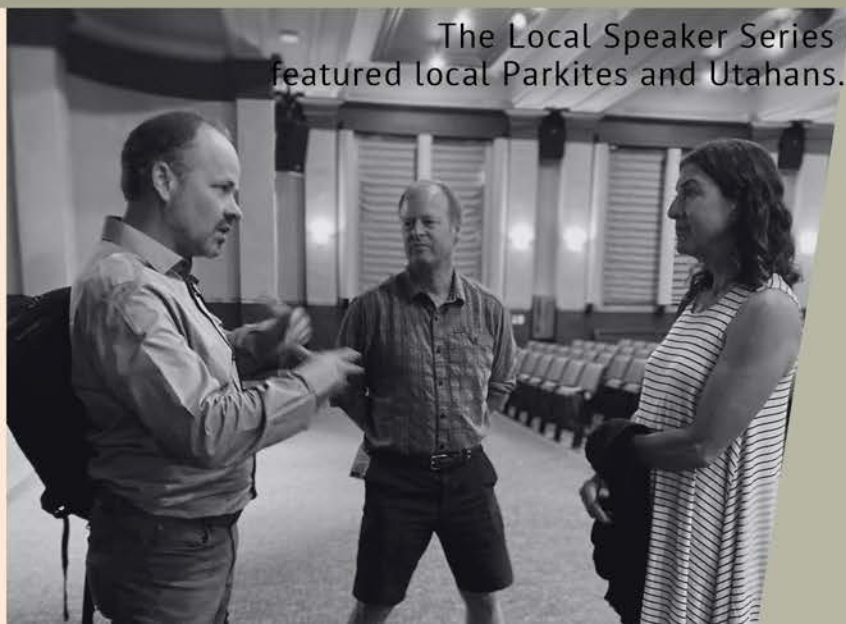
The Local Speaker Series featured local Parkites and Utahans.