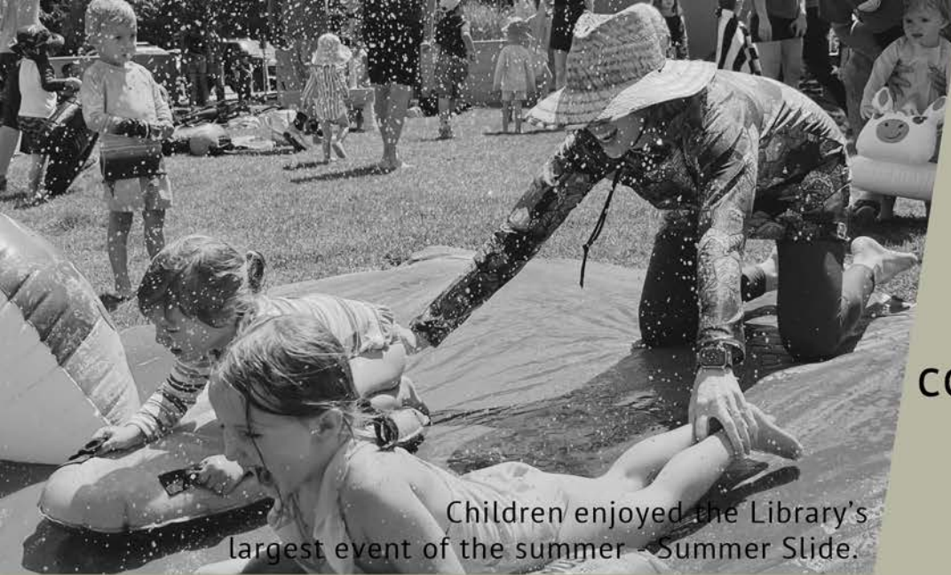
Children enjoyed the Library's largest event of the summer - Summer Slide.