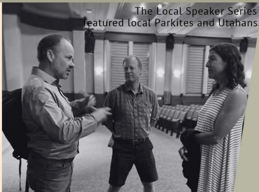
The Local Speaker Series featured local Parkites and Utahans.