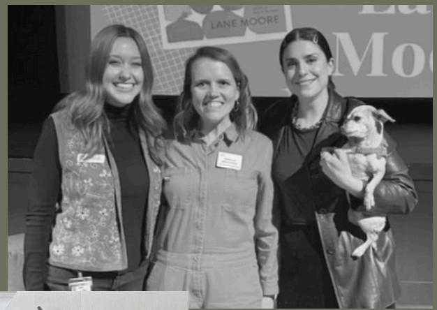
THE LIBRARY PARTNERED WITH THE WOMEN'S GIVING FUND TO BRING LANE MOORE - AUTHOR, ACTRESS, COMEDIAN, AND MUSICIAN - TO THE LIBRARY FOR A PRESENTATION AND BOOK SIGNING