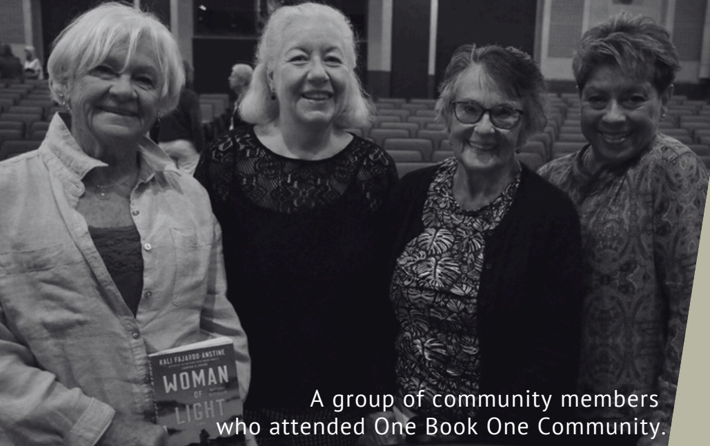
A group of community members who attended One Book One Community.