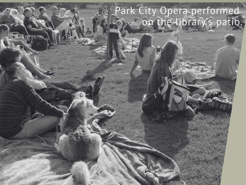
Park City Opera performed on the library's patio.