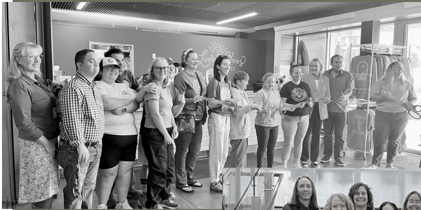
LUCKY ONES COFFEE CELEBRATED BEING AT THE LIBRARY FOR SIX YEARS WITH A RIBBON-CUTTING THAT HIGHLIGHTED A FRESH LOOK