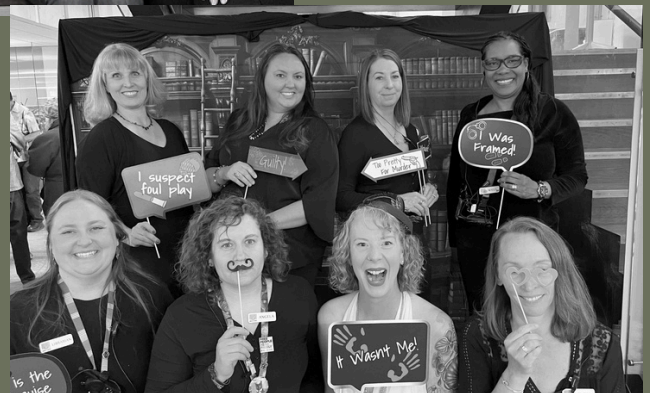
LIBRARY STAFF POSED FOR A PICTURE DURING THE WASATCH BACK BOOK FESTIVAL

Thank you to everyone who supported the Library in a year that saw the highest number of visitors ever recorded as 261,720 people came through our doors. This points to a host of successful programs, services, and resources that have been embraced by the community in our state-of-the-art facility and a staff that makes everyone feel welcome. We were recognized with the Quality Library Award by the Utah State Library for rising above and beyond statewide library standards, with special mention for our transformational services. We are grateful to the City Council, City Administration, the Library Board, the Friends of the Library, and our community who believe in our Library's Mission to "Empower Minds, Inspire Imagination, and Connect Community."